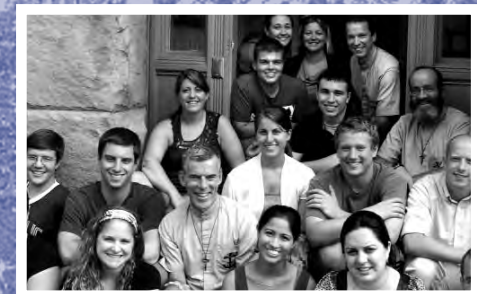
READY FOR ACTION! Student Leaders, Interns and Staff, ready to begin a new year of outreach at the HUB.