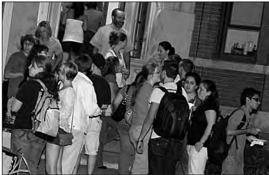
"WHERE YA FROM?" Students gather at the NU Catholic Center - the core community for the new Catholic Student Association HUB initiative.

The students we've already evangelized and trained at Northeastern will be a crucial part of this mission. Also the brothers will be in touch with area colleges, connecting with staff and exploring the needs of their Catholic students. By the second year we hope to invite students to Bible studies and other 'in house' events on their own campuses. We wish to connect as many students and schools as we can to the HUB to foster a central identity through 'block party' events as well as local, on-campus identities that build ownership at each HUB campus.